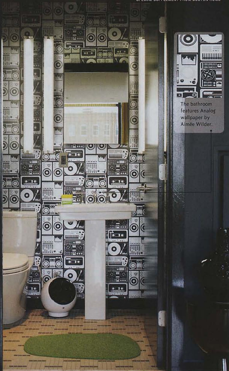
The bathroom features Analog wallpaper by Aimée Wilder.