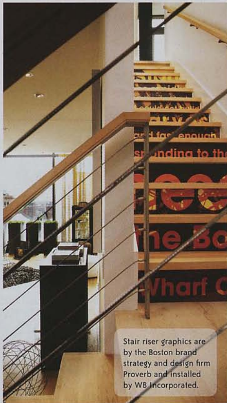
Stair riser graphics are by the Boston brand strategy and design firm Proverb and installed by WB Incorporated.